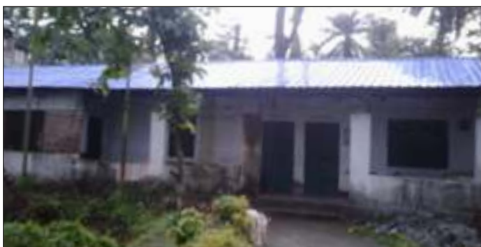
Renovated School Building

Club undertook a repair and renovation project for one of the single storied blocks of the Saroj Nalini Primary School at its R.C.C. Mirpur Rural Centre Mirpur, Village Mirpur, P.O. Chak Enayet Nagar, P.S. Bishnupur, Dist. 24 Pgs (S), PIN 743503, damaged in Amphan cyclone a few months back. The project was undertaken under the Helping Grant of Eastern India Rotary Welfare Trust (EIRWT).