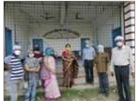
President & Secretary gave brief speeches on Rotary activities and distributed mosquito nets among some of the underprivileged families of Baruipur.