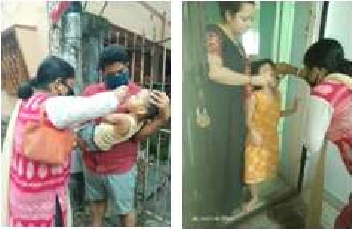
Health workers went door to door to administer polio drops to the children within K.M.C. Ward 96.

A Pulse polio awareness program was organized by Rotary International Dist3291 during 20th September to 26th September. Rotary Club New Ballygunge participated in the awareness program and campaigned within K.M.C. Ward no.96, falls under its purview. 51 nos. of health workers visited the houses within this Ward, to provide polio drops to the children. RCNB's sincere campaign in and around the booths was found effective. Total 1006 children were immunized in ward no. 96.