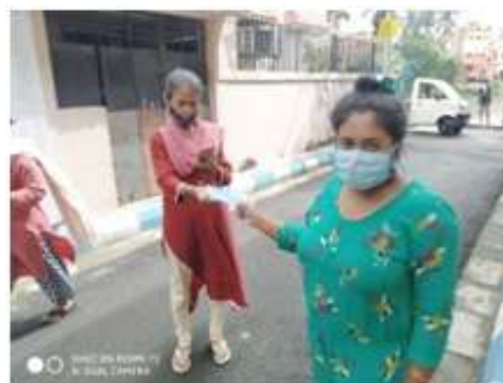
Masks & sanitizers were distributed among the 50 health workers of K.M.C. Ward 96.