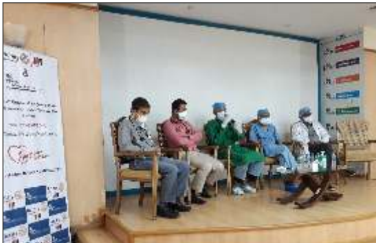
Panel Discussion Part 1