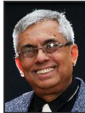
District Governor Elect Prabir Chatterjee 2021-22