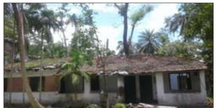
Damaged School Building

E-mail Address of our club : rcnb3291@gmail.com