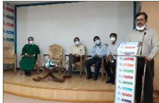
Panel Discussion Part 2