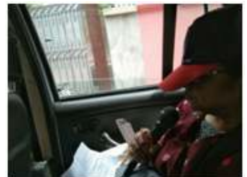
President & Secretary in the polio awareness campaign programme.