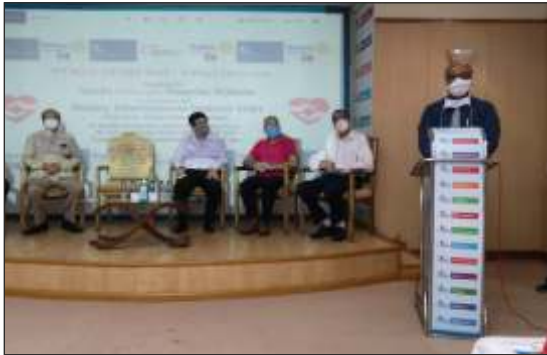
The Inaugural Session